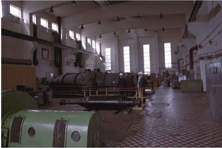
Main Turbine Hall, Elektrociepłownia Gorzów, 1991

backgrounds in finance, engineering and project development.